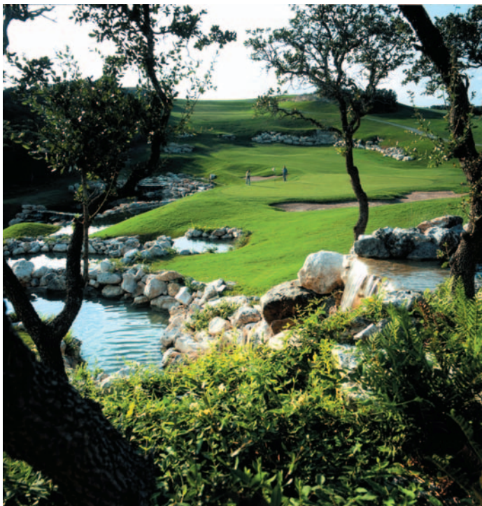
The golf courses at the Westin La Cantera are some of the best in the world.

The resort's Castle Rock Health Club & Spa boasts a state-of-the-art facility with more than enough equipment to keep you moving. A Reebok Core Training Zone is at the heart of the Westin WORKOUT (SM), with specially designed equipment to